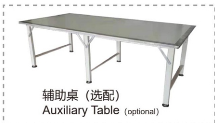
辅助桌 (选配) Auxiliary Table (optional)