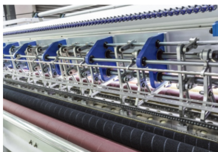
Aluminum alloy needle and pressure rod holder 铝合金针、压杆架