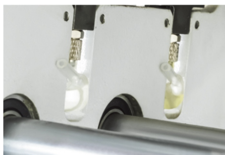
Unique oil bag oil supply system 独特的油囊供油系统

Customized model are available to meet client's various needs / 可按客户需求订做特殊机型