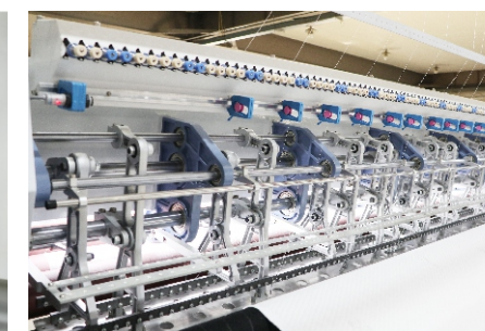
Aluminum alloy needle bar frame and pressing-bar frame 铝合金针杆架、压杆架