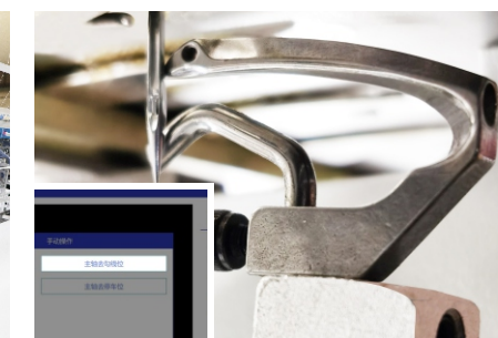
One-click operation of Spindle back to Thread-hooking position on HMI 主轴去勾线位，一键操作