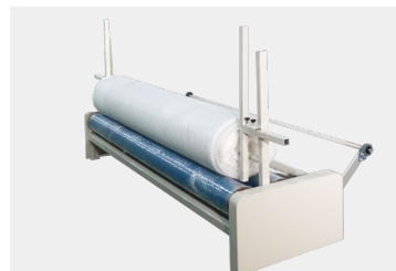
Material Collecting Rack