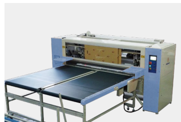
Conveyor Belt Cutting Machine