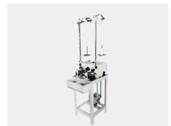
Automatic Shuttle Winding Machine