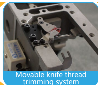
Movable knife thread trimming system