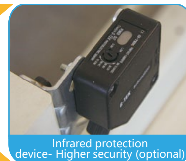
Infrared protection device- Higher security (optional)