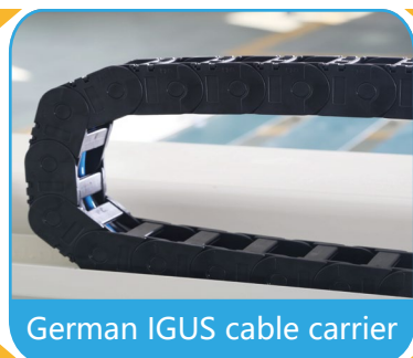
German IGUS cable carrier