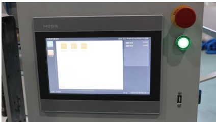
人机交互触摸屏设计 Design of Human-computer Interactive Touch Screen