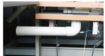
负压吸纳装置 Vacuum Absorption Device