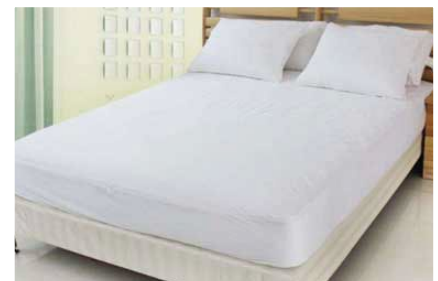
应用效果 Application Effect