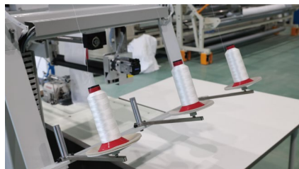
大线轴设计 Large Size Spool