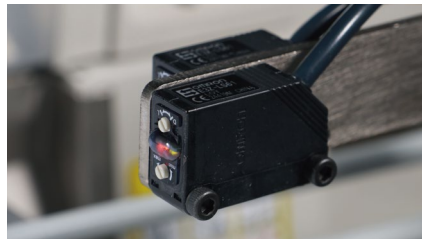
自动对边功能 Automatic Edge Alignment Function