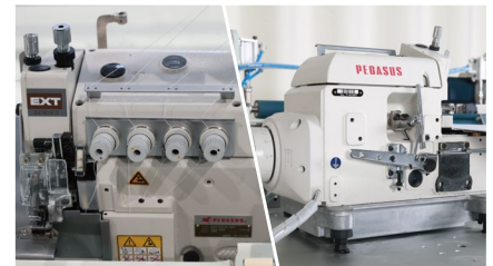
上/下机头: 飞马包缝机 Upper/Lower Machine Head: Pegasus Overlock Sewing Machine