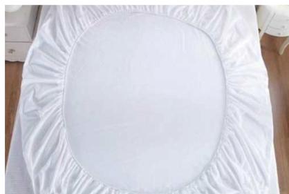
成品效果 Finished Product Effect