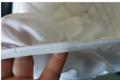
橡筋拷边效果 Rubber Band Edging Effect

Suitable for the processing of bedsheets, integrating the stitching of rubber bands and skirt edges, as well as the stitching of skirt edges and negatives.