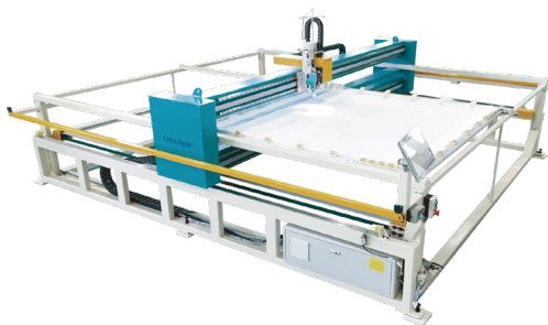
Computerized Single Needle Quilting Machine-lifting Head