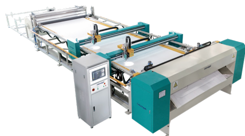
Continuous Feeding Double Saddles Quilting Machine (with Supporting Belt)