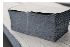
牛仔面料 Denim Fabric