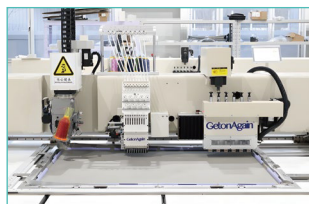
专用冲孔、绣作、缝制机头 Specialized Punching, Embroidery and Sewing Heads