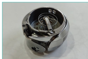
专用2.6倍旋梭 Specialized 2.6x Rotary Hook