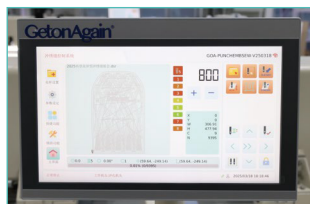
高清触摸屏 High-Definition Touch Screen