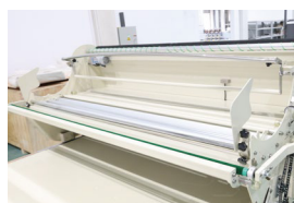
加大布斗850mm Enlarged Fabric Hopper 850mm