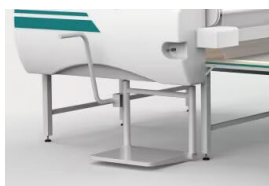
站人平台 Operator Platform