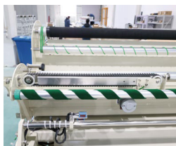
多道拨边装置 Multi-Path Edge Poking