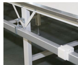
电导轨 Electric Guide Rail