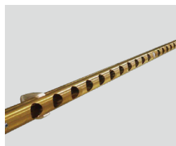
除静电装置 Antistatic Device