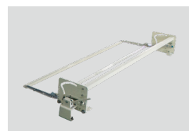
后压布夹装置(之字型铺布) Rear Fabric Pressing Clamp (Zigzag Fabric Spreading)