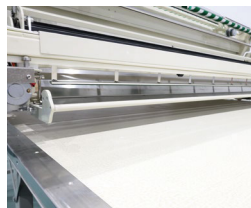
加高至300mm Raised to 300mm