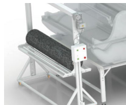
自动上料装置 Automatic Roll Loader