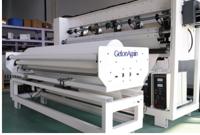
放卷机导辊采用不锈钢材质。 Guide rollers of the unwinding machine are made of stainless steel.