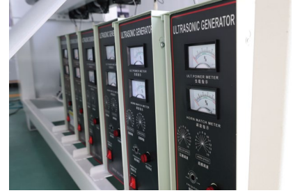
超声波装置数量：6 套 No. of Ultrasonic System: 6 sets