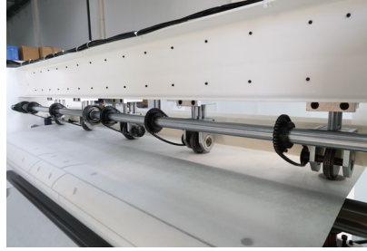
机器配有一根特殊 AL 导辊，防止起皱。 Machine is equipped with a special aluminum guide roller to prevent wrinkling.