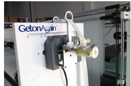
夹辊 - 4 个，由橡胶制成，每个直径约 5 英寸。 Pinch Rollers - 4 sets, with made of rubber, each with a diameter of approximately 5 inches.