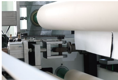
超声波横切数量：1 套 No. of Ultrasonic Cross Cutting: 1 set