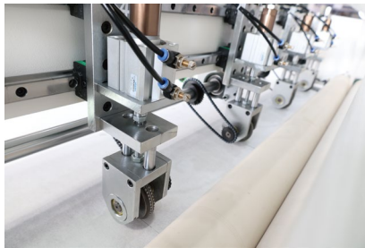
超声波纵切数量：5 套 No. of Ultrasonic for Vertical Cutting: 5 sets