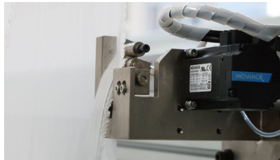
净边装置 Edge Trimming Device