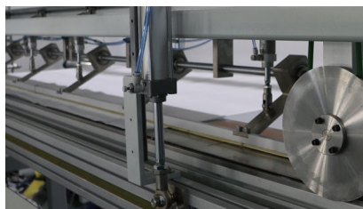
SMC气动元件 SMC Pneumatic Components