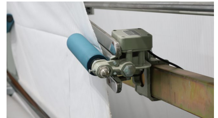
吸边器 Edge Catcher