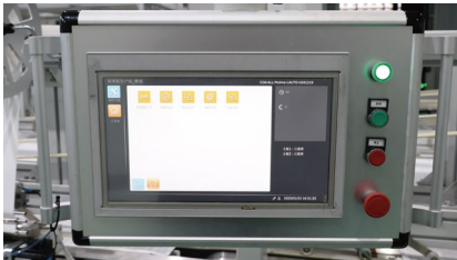
再登高电脑控制系统 GA Computerized Control System