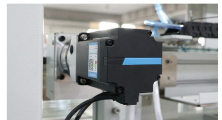
伺服电机 Servo Motor