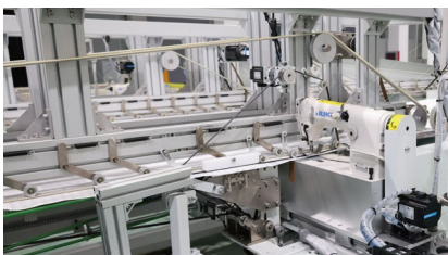
送布环带 Fabric Feeding Loop-belt