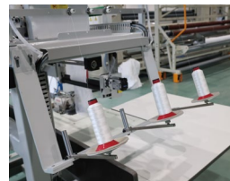
大线轴设计 Large Size Spool