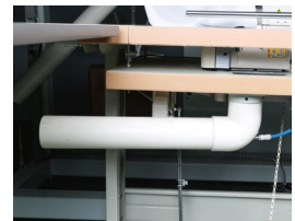
负压吸纳装置 Vacuum Absorption Device