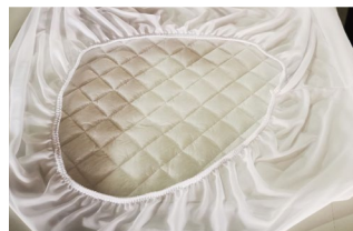
成品效果 Finished Product Effect