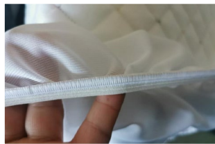
橡筋拷边效果 Rubber Band Edging Effect

适用于床笠的加工，一体化完成橡筋与裙边，裙边与底片的拷边缝合。 Suitable for processing fitted bedsheets, integrating the overlock stitching of elastic rope cord and skirt edges, as well as the overlock stitching of skirt edges and mattress protector topper sheet.