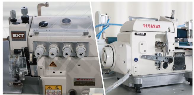
上/下机头: 飞马包缝机 Upper/Lower Machine Head: Pegasus Overlock Sewing Machine