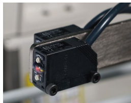
自动对边功能 Automatic Edge Alignment Function