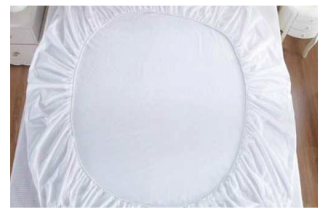
成品效果 Finished Product Effect