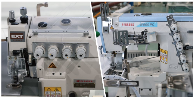
上机头: 飞马绷缝机/下机头: 飞马包缝机 Upper head: Pegasus Interlock Lower head: Pegasus Overlock