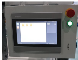
人机交互触摸屏设计 Design of Human-computer Interactive Touch Screen