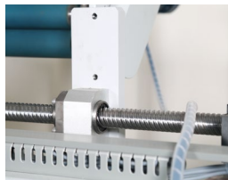
丝杠驱动 Lead Screw Drive