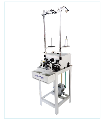
全自动飞梭绕线机 Automatic Shuttle Winding Machine