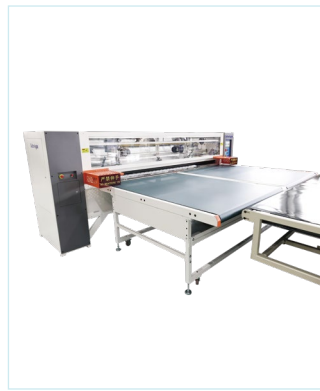
输送带裁切机 Conveyor Belt Cutting Machine