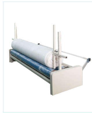
收料架 Material Collecting Rack