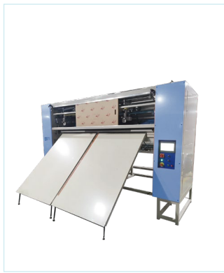
裁切机 Cutting Machine